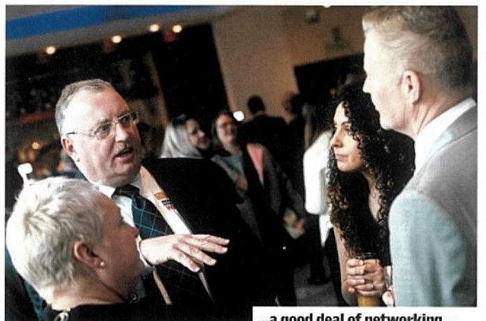
...a good deal of networking...