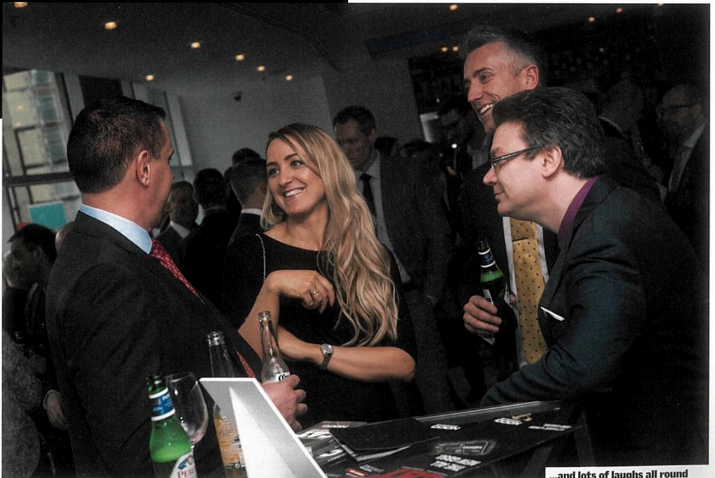
...and lots of laughs all round