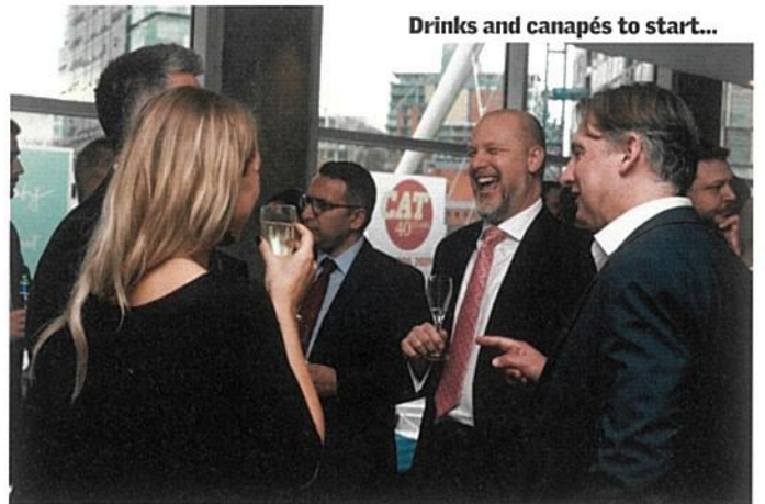
Drinks and canapés to start...