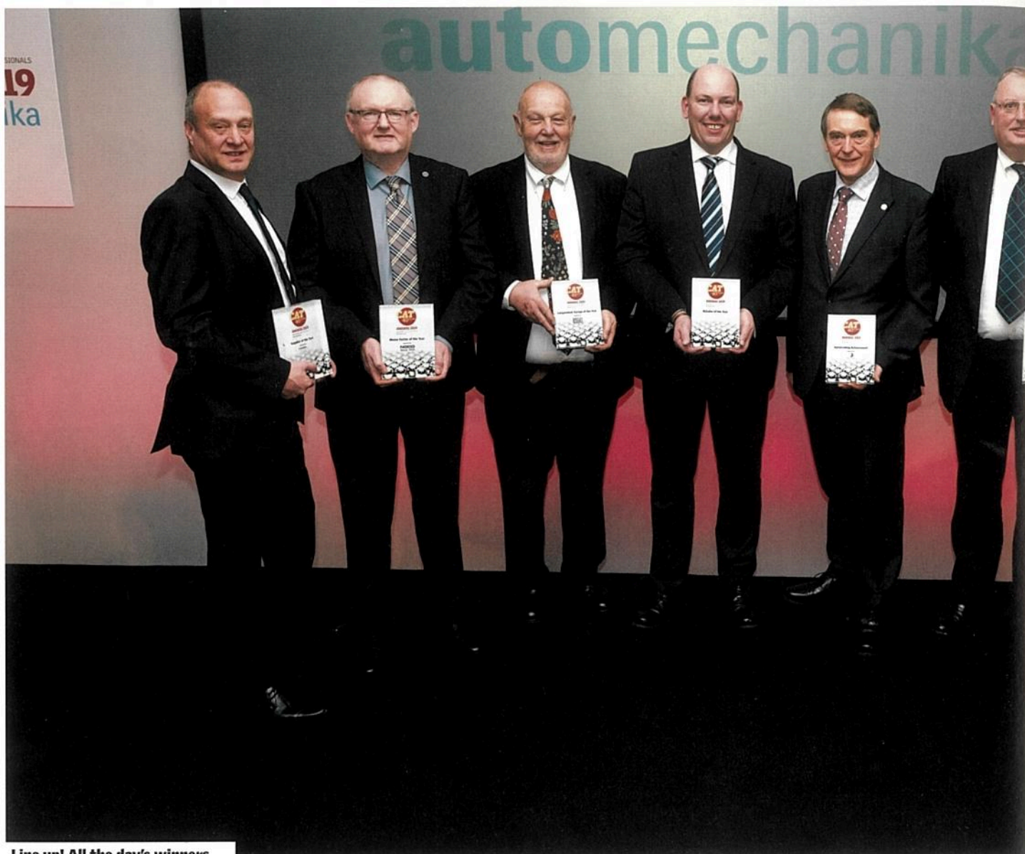
Line up! All the day's winners